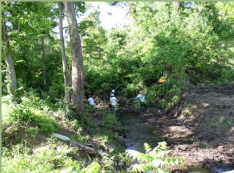
Workers collect debris at a previous NRCS' EWP site.