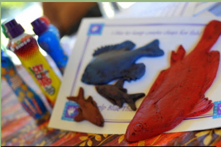
Fish print materials at a Natural Resource Day.