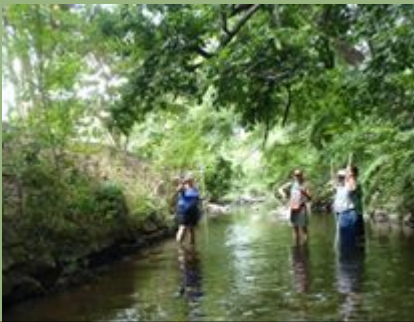
Tulsa Area volunteers assisting Blue Thumb fish collections