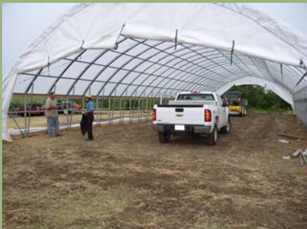
NRCS provided funding support to assist agricultural producers in the county to install, "High Tunnel" houses for growing vegetables and berries.

Services and programs provided by the Tulsa County Conservation District and NRCS are offered on a nondiscriminatory basis without regard to age, race, color, national origin, religion, gender, marital status or physical disability.