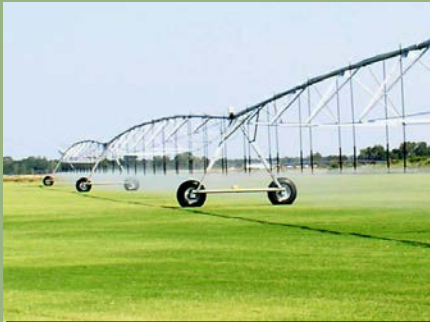
A cooperators irrigation project installed through NRCS' EQIP program provides more efficient irrigation for agricultural crops.