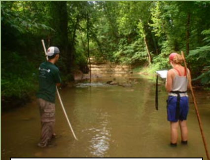
TCCD and Blue Thumb staff conducting a habitat assessment on Mooser Creek