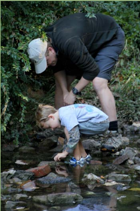
Father and son searching for bugs after TCCD discussed the importance of macroinvertebrates at a Brookside Neighborhood Association event on Crow Creek.