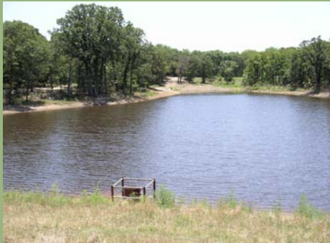
Pond construction has been one of the conservation practices included in the Conservation Cost Share Program.