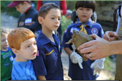
A group of boy scouts learns about reptiles at the Brookside Neighborhood Association's Zink Park Work Day in October 2010.