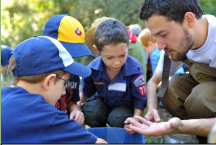
Tree cookie activity with Oklahoma Union students at a Natural Resource Day.