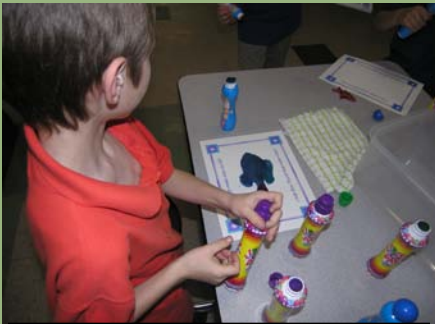
A child making fish prints during a Natural Resource Day.