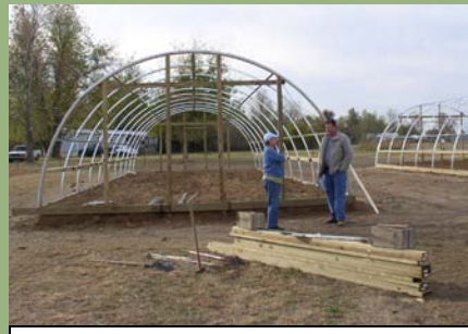
NRCS provided funding support to assist agricultural producers in the county to install, "High Tunnel" houses for growing vegetables and berries.

Services and programs provided by the Tulsa County Conservation District and NRCS are offered on a nondiscriminatory basis without regard to age, race, color, national origin, religion, gender, marital status or physical disability.