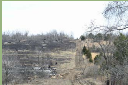
Prescribed Burning is used to control Eastern Redcedars in Tulsa County.