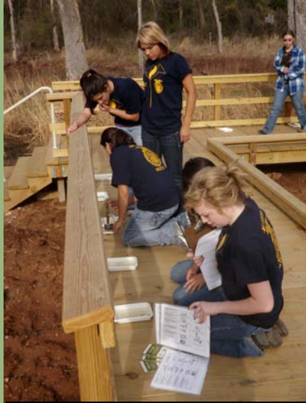
Students competing in the aquatics portion of the State Envirothon contest.