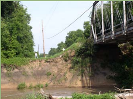
Debris removal from EWP project at Collinsville supervised by NRCS.