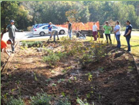
TCCD volunteers assisting with the construction of a rain garden at Ray Harral Park in Broken Arrow