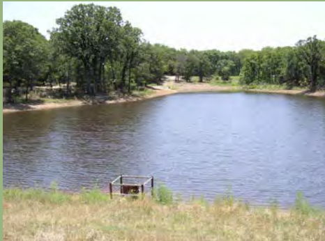
Pond construction has been one of the conservation practices included in the Conservation Cost Share Program.