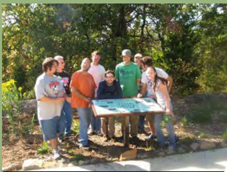
TCCD volunteers assisting with the installation of rain garden signage at Remington Elementary.