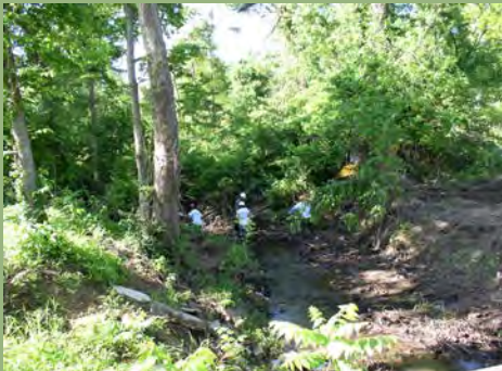
Workers collect debris at the NRCS' Collinsville EWP site.