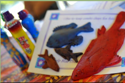
Fish print materials at a Natural Resource Day.