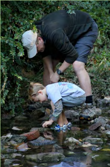
Father and son searching for bugs after TCCD discussed the importance of macroinvertebrates at a Brookside Neighborhood Association event on Crow Creek.