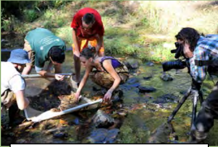
Volunteers assisted with a macroinvertebrate collection, while Ch 2 was filming, at a Brookside Neighborhood Association event.