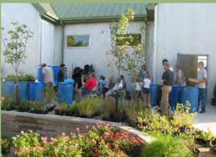
Rain barrel workshop at Grogg's Green Barn.