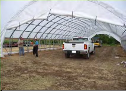
NRCS provided funding support to assist agricultural producers in the county to install, "High Tunnel" houses for growing vegetables and berries.

Services and programs provided by the Tulsa County Conservation District and NRCS are offered on a nondiscriminatory basis without regard to age, race, color, national origin, religion, gender, marital status or physical disability.