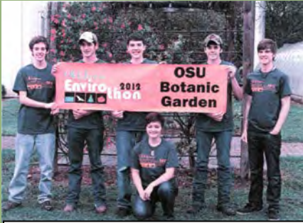
Owasso 2012 team at the State Envirothon contest at OSU Botanic Gardens.