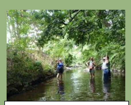
Tulsa Area volunteers assisting a Blue Thumb fish collections