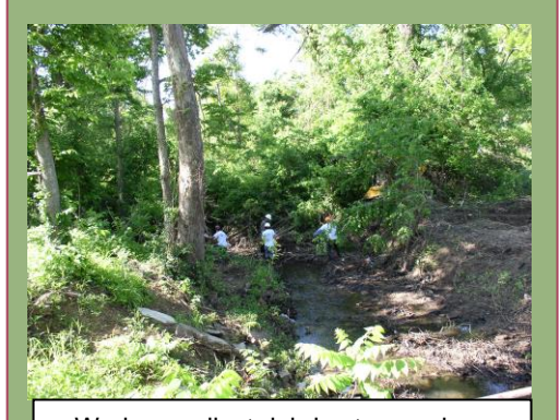
Workers collect debris at a previous NRCS' EWP site.