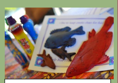
Fish print materials at a Natural Resource Day.