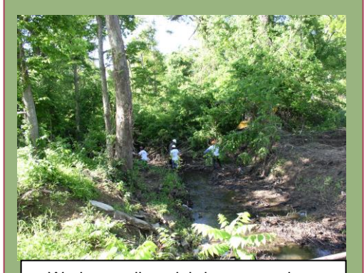
Workers collect debris at a previous NRCS' EWP site.