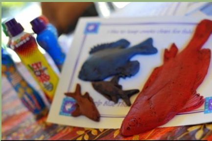
Fish print materials at a Natural Resource Day.