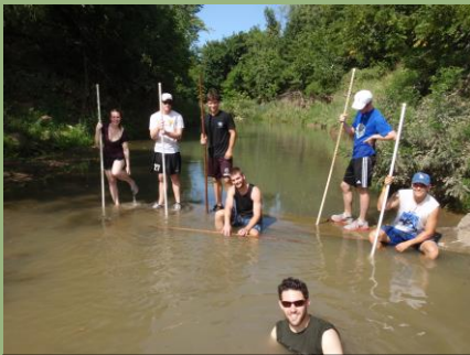
University of Tulsa volunteers assisting a Blue Thumb fish collections