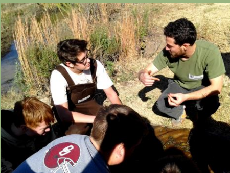
Broken Arrow High School students during a macroinvertebrate collection on their Blue Thumb Monitoring site, Adams Creek.