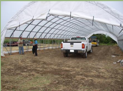
NRCS provided funding support to assist agricultural producers in the county to install, "High Tunnel" houses for growing vegetables and berries.

Services and programs provided by the Tulsa County Conservation District and NRCS are offered on a nondiscriminatory basis without regard to age, race, color, national origin, religion, gender, marital status or physical disability.