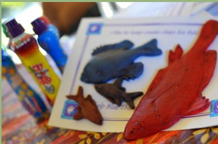
Fish print materials at a Natural Resource Day.