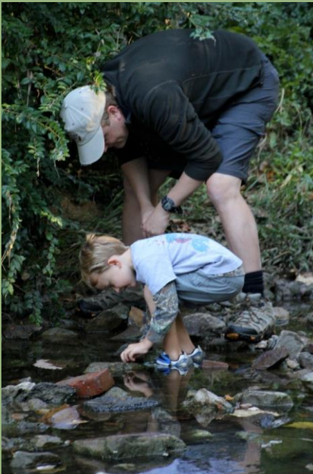
Father and son searching for bugs after TCCD discussed the importance of macroinvertebrates at a Brookside Neighborhood Association event on Crow Creek.