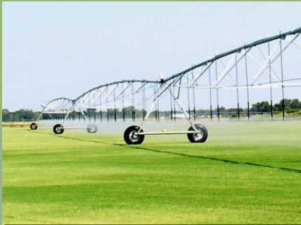
A cooperators' irrigation project installed through NRCS' EQIP program provides more efficient irrigation for agricultural crops.