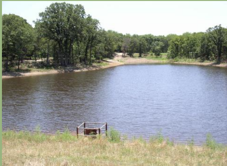
Pond construction has been one of the conservation practices included in the Conservation Cost Share Program.