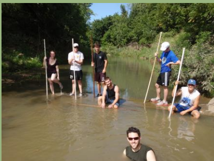
University of Tulsa volunteers assisting a Blue Thumb fish collections