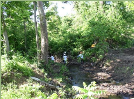
Workers collect debris at a previous NRCS' EWP site.