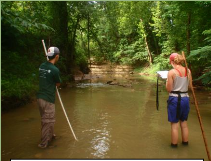
TCCD and Blue Thumb staff conducting a habitat assessment on Mooser Creek