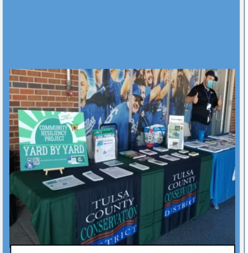
Tulsa County Conservation District and the City of Tulsa Recycling and Refuse at the Tulsa Driller's Game May 2021