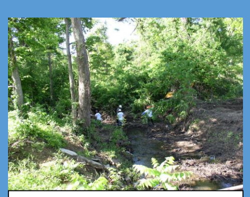
Workers collect debris at a previous NRCS' EWP site in another part of the region. NRCS did not have any EWP's in Tulsa County