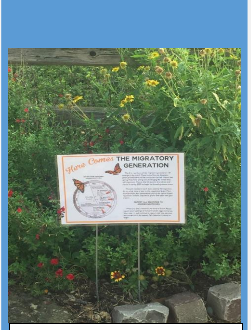
Monarch's on the Mountain Migration Sign at Turkey Mountain September 2020