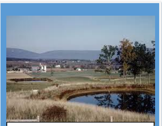
Pond construction has been one of the conservation practices included in the Conservation Cost Share Program.