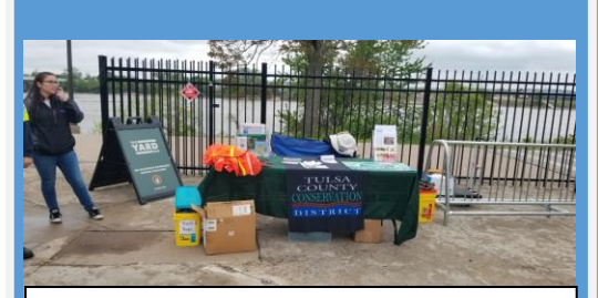
Arkansas River Cleanup at the Yard Bar April 2021