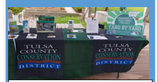
Tulsa County Conservation District at the M.e.t's Enviro Expo in April 2022. It was a little wet but a beautiful day to celebrate Earth Day!