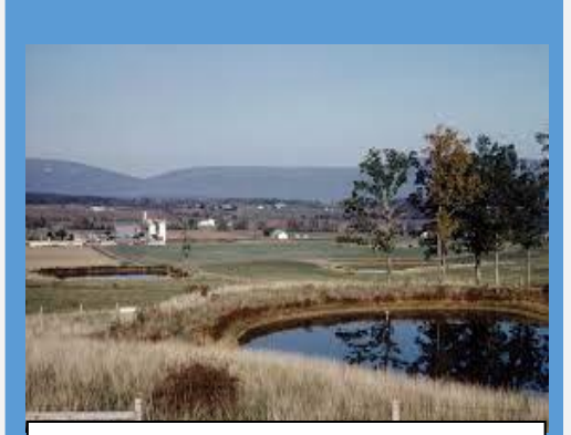
Pond construction has been one of the conservation practices included in the Conservation Cost Share Program.