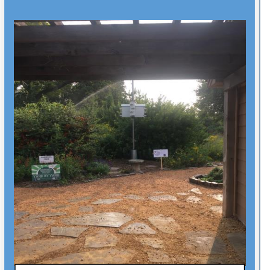
Tulsa County Conservation District assists River Parks and Monarch's on the Mountain plant a pollinator garden next to our Yard-by-Yard sign.