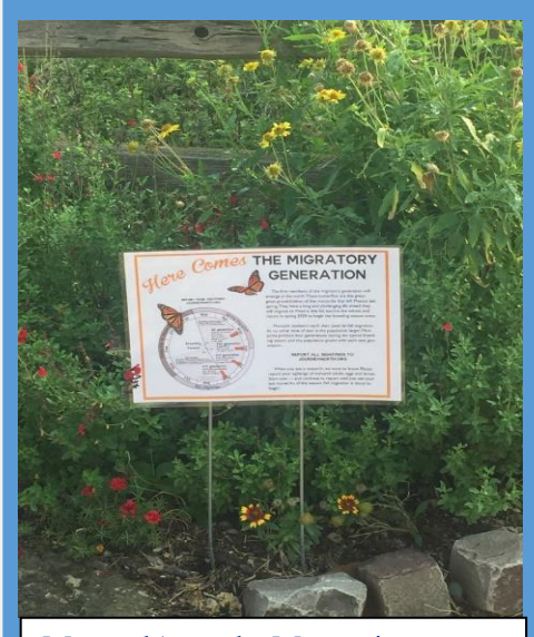
Monarch's on the Mountain Migration Sign at Turkey Mountain