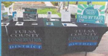
Tulsa County Conservation District at the M.e.t's Enviro Expo in April 2022. It was a little wet but a beautiful day to celebrate Earth Day!