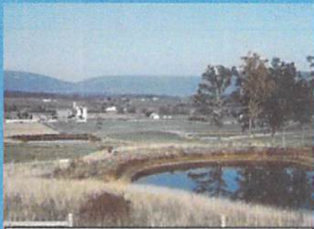
Pond construction has been one of the conservation practices included in the Conservation Cost Share Program.

The Tulsa County Conservation District currently does not have any equipment available to producers in Tulsa County. However, producers do have the ability to rent equipment from surrounding counties. Our district focuses on outreach education, while also working alongside NRCS to provide financial and technical assistance to local landowners through the State Cost Share Program. We do have some classroom materials that are available to check out with a deposit. Supplies include books, soil discovery kits, hand lenses, tree books, sample dishes, bug boxes, rocks, macroinvertebrate samples and others.