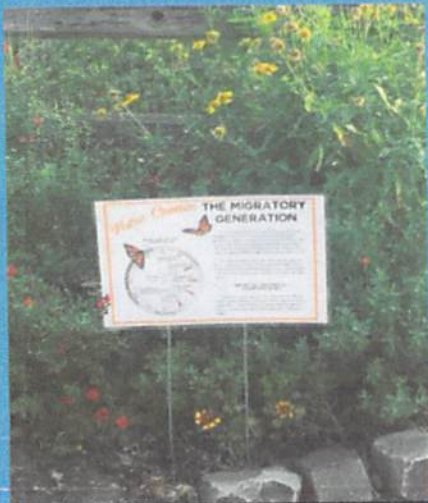
Monarch's on the Mountain Migration Sign at Turkey Mountain