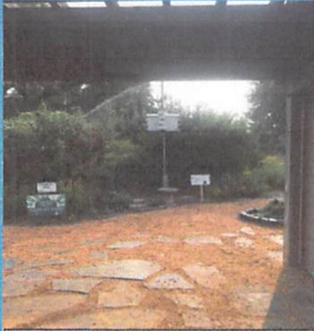
Tulsa County Conservation District assists River Parks and Monarch's on the Mountain plant a pollinator garden next to our Yard-by-Yard sign.