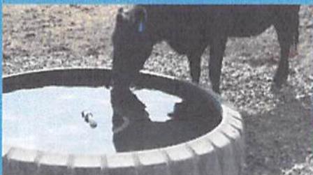
Livestock watering facility built with Conservation Cost Share Program.