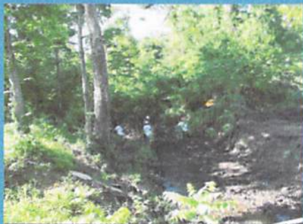
Workers collect debris at a previous NRCS' EWP site in another part of the region. NRCS did not have any EWP's in Tulsa County